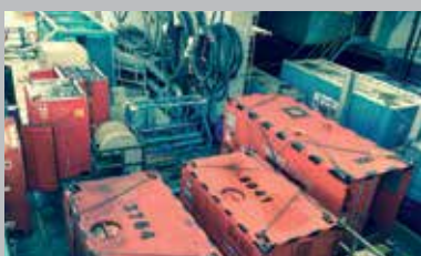
Regional Focus: Den helder - pg.6