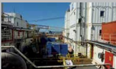
Case Study: Borgholm Dolphin - pg.2