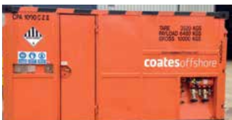
Successful testing with Petrofac: 1000cfm Containerised Zone II Air Compressor