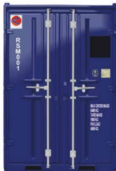
Bottom: 10ft removable side half height 15ft, 20ft and 23ft versions available