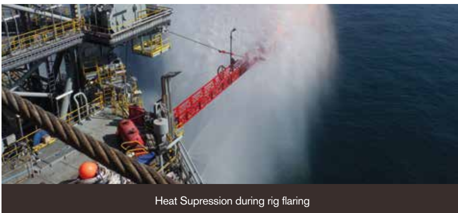
Heat Suppression during rig flaring