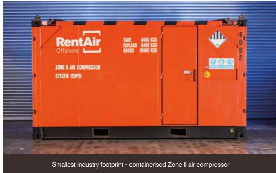
Smallest industry footprint - containerised Zone II air compressor

At RentAir Offshore we always work to optimise deck utilisation, addressing footprint and weight