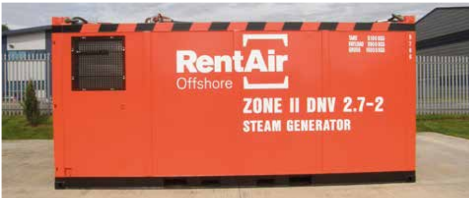
New: Fully certified DNV2.7-2 Zone II Steam Generator