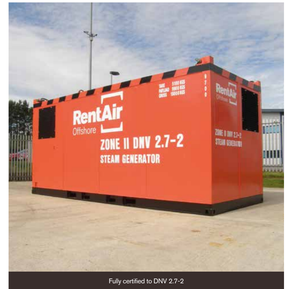
Fully certified to DNV 2.7-2