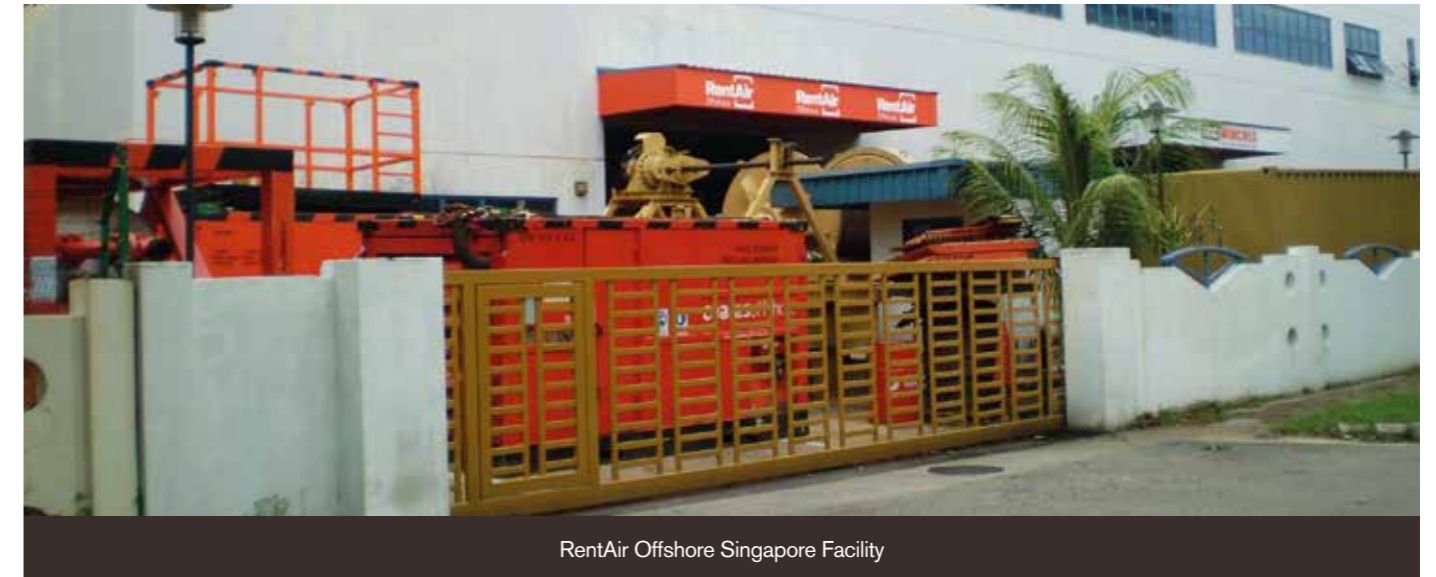
RentAir Offshore Singapore Facility